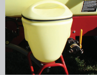
Capacity induction hopper which makes the filling of chemicals fast and easy.