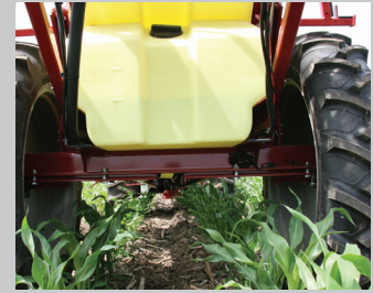
RinseTank is mounted at the rear of the main tank above the axle to optimize weight distribution.