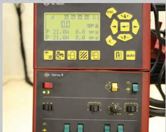
Well proven reliable spray controllers: • HC 2500 or • HC 5500